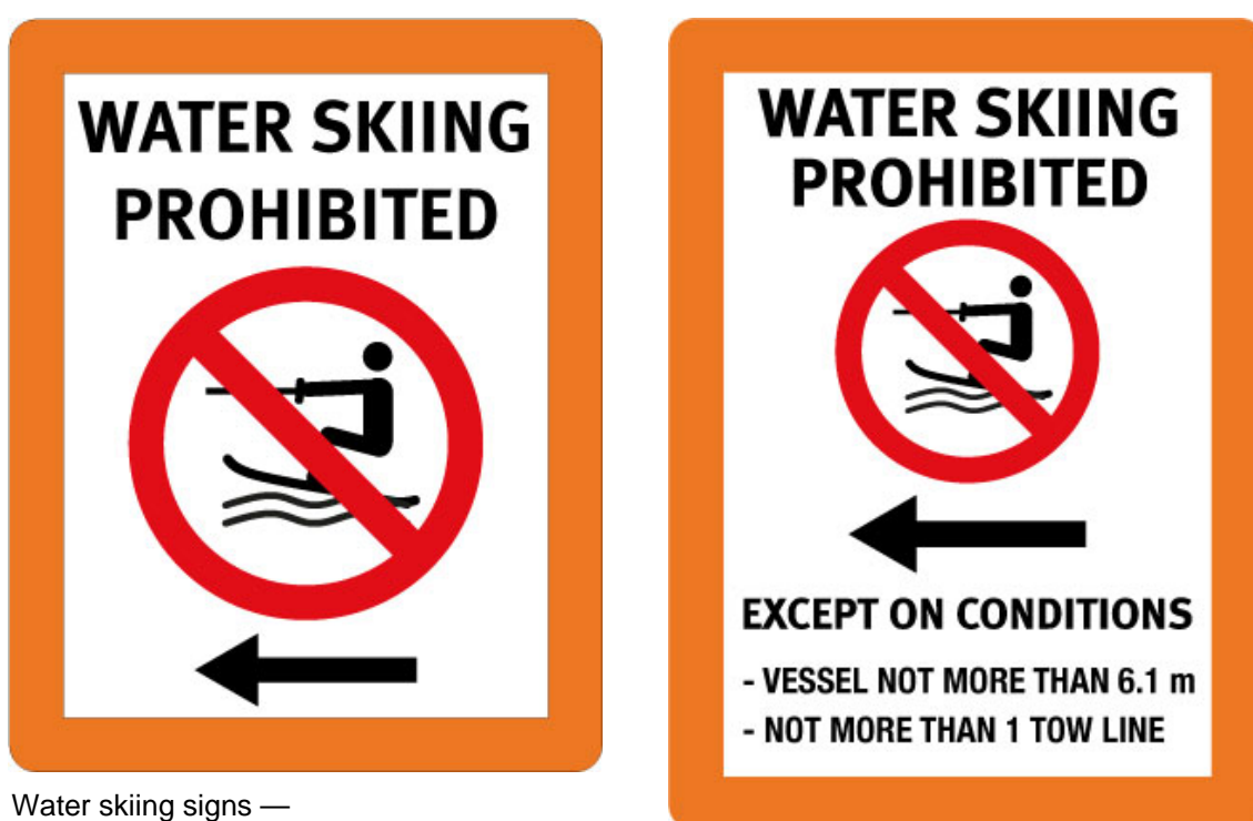
Water skiing signs — Standard: 1,100 mm (W) x 1,400 mm (H) On conditions: 1,100 mm (W) x 1,500 mm (H)

The warning signs, the water skiing signs and the speed sign for the operational speed limit are new signs not currently described in Maritime Safety Queensland's Standard Endorsed Equipment Catalogue .